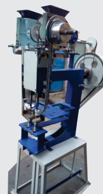
Eyelet Punching Machine