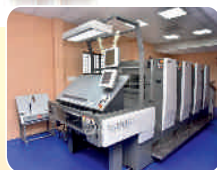
KOMORI ENTHRONED MACHINE

Delhi Printers' Association OD A/C No.020700845501 IFSC Code-HDFC0CTJCBL Bank Name-The Janata Co-Operative Bank Ltd.