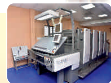
KOMORI LITHRONE MACHINE

TEL. 011-49148130, +91-9818944020 / +91-9911809400