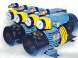
D LV 1000 C DVVL For Heidelberg Double Color