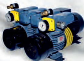
D LV 1000 C DV For Komori Offset